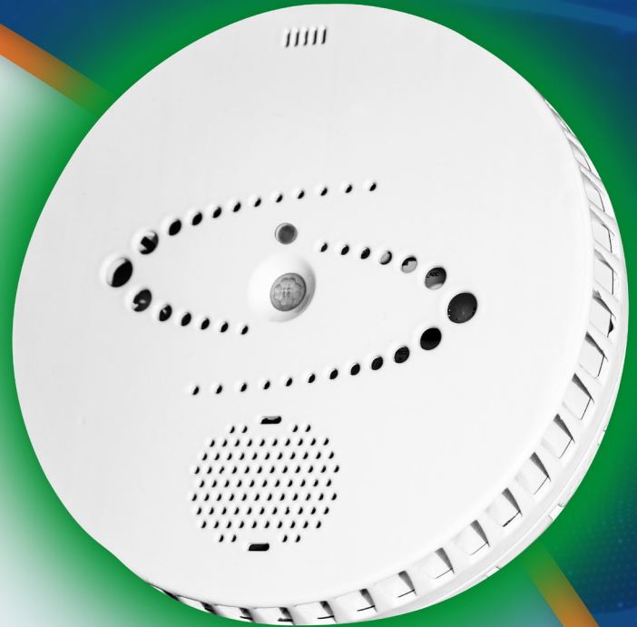
HALO Smart Sensor is Multi-Patented and Design is Trademarked

New security and environmental monitoring features provide users with even greater levels of security and easier installation. These features add to HALO's existing features of gunshot detection, noise alerts, and emergency keyword alerting.